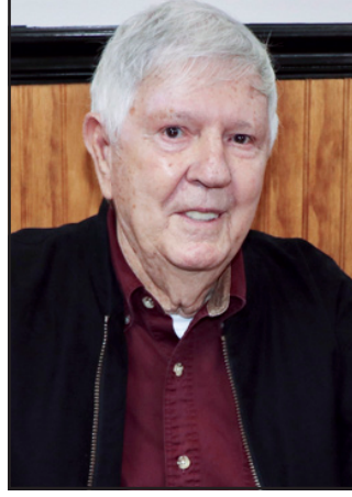
blast with cake and friends at his birthday party last week.